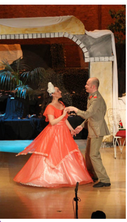
Poso lipamai (how sorry I am)