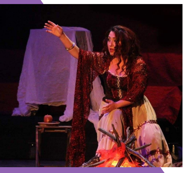
Love, your magic spell is everywhere