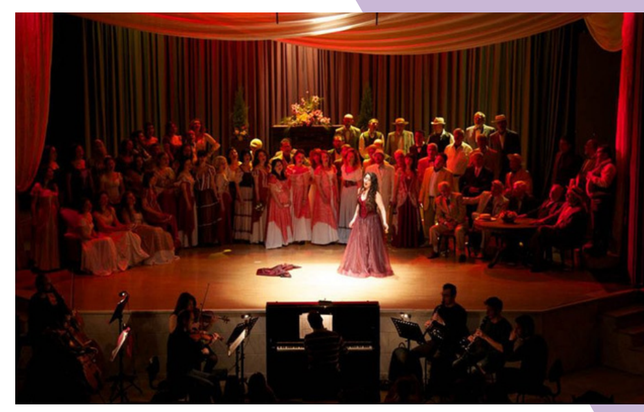
The valse will begin - Godson (greek operetta)